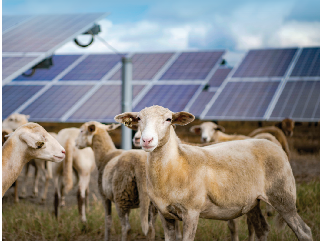
A herd of sheep at the FPL Blue Cypress Solar Energy Center maintain the grounds, helping keep the grass low.

Be among the first to get program updates. Visit: » FPL.com/solartogether