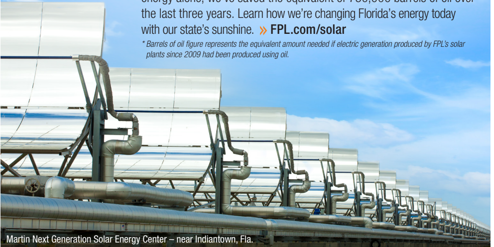
Martin Next Generation Solar Energy Center – near Indiantown, Fla.

* Barrels of oil figure represents the equivalent amount needed if electric generation produced by FPL's solar plants since 2009 had been produced using oil.