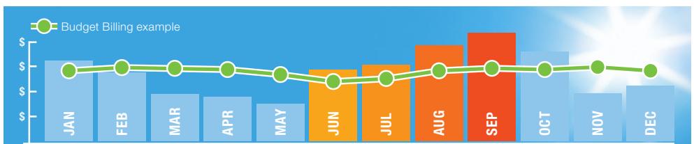
Graph for illustrative purposes only