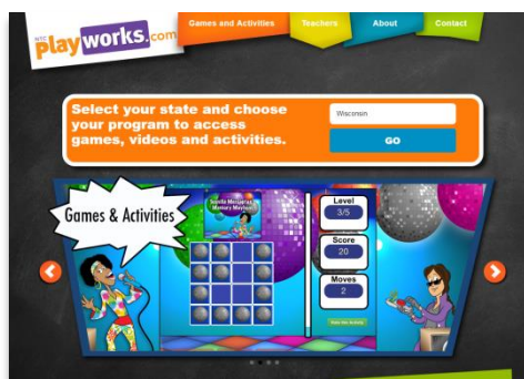
Digital classroom materials

Along with the in-school assembly, digital games and activities are provided to expand upon the educational content of the program.